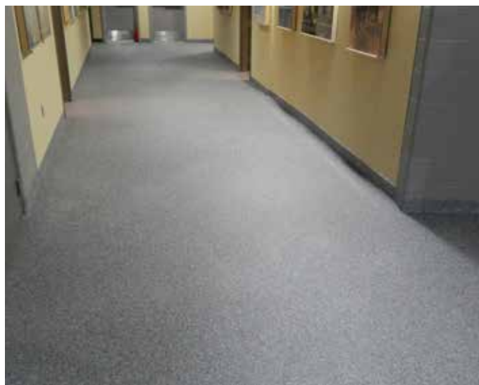
Used as a top coat over Belzona 5231 with locally-sourced flakes

For more information, please contact your local Belzona representative: