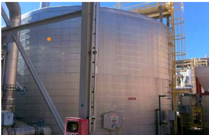
Belzona 4331 can be applied as a lining to protect tanks

For more information, please contact your local Belzona representative: