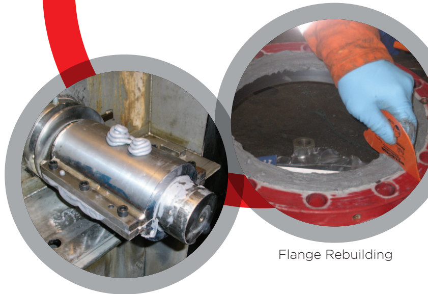
In-situ Shaft Forming