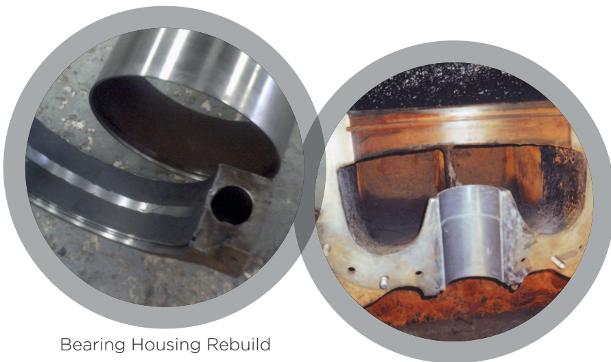
Bearing Housing Rebuild